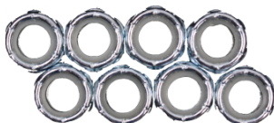
7/16" Lock Nut Qty ( 8 )