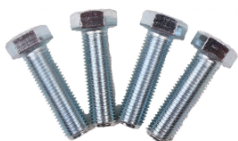
1 1/34" (7/16") Grade 5 Hex Shoulder Mounting Bolts Qty ( 4 )