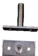
1/2" Stud Plate Anchor Qty ( 2 )