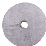
2.5" Flat washer/anchor Plate Qty ( 4 )