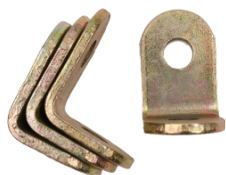
90 Degree Anchor Bracket Qty ( 4 )